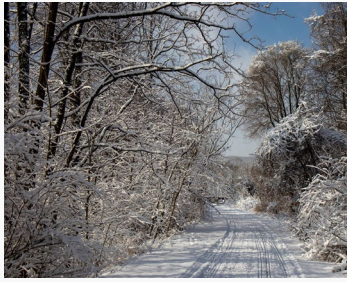
West Creek Recreational Trail open to snowmobiles.