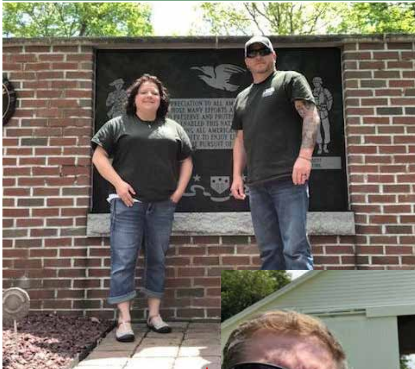
Mount Joy War Memorial